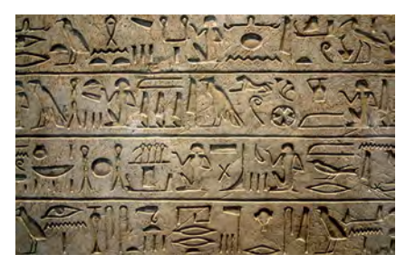
If it sounds like a translation, it's not good!

So, what are the qualities that make a translation good? A translation needs to meet several criteria in