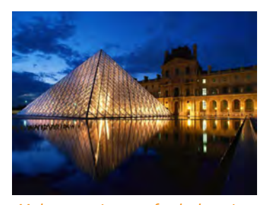
Make your trip more fun by learning a bit of the language before you go

If you're planning a trip to Europe, don't leave without taking our exciting European Tour class! This first-of-its-kind eight-week class will teach you essential phrases and vocabulary in Spanish,