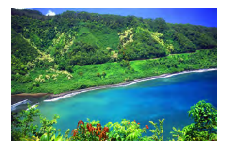
Only 0.1% of Hawaiians are native speakers

What better language to focus on in winter than Hawaiian? It is a melodic and flowing Polynesian language